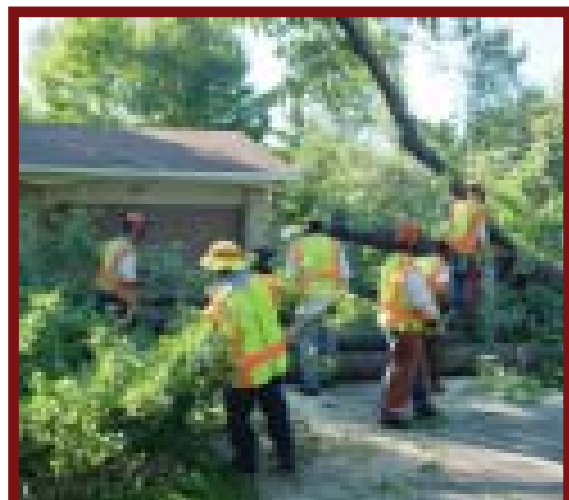
Cleaning up after summer storms