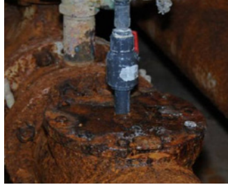
Well and water treatment at Stillwater is inadequate to provide fire protection

The legislative session started January 24, and Governor Dayton proposed over $53 million in general obligation (GO) bonds for the DOC. GO bonds are a type of municipal bond used by state or local government to raise funds for public works. Of the $53 million in GO bonds, $15 million is recommended toward general repair, replacement, and renewal in the 10 facilities; $5.4 million to construct a Shakopee perimeter security fence; $29.9 million toward building a new St. Cloud intake unit, health services unit, and loading dock; and $3.4 million to replace the Stillwater well and water treatment facility.