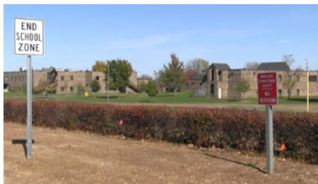
View of Shakopee Prison from neighboring elementary school.