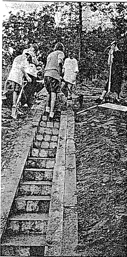
Youths earn money for their victims in a Minnesota restorative program.

Public safety can't be improved without active community involvement. The community has tools, resources and power that the system does not. Community members know what affects the offender's behavior and what might motivate the offender to change. They may be able to better monitor whether the offender fulfills the requirements of community service or other activities. Criminal justice system activity needs to be built around a core of community activity - not the reverse.