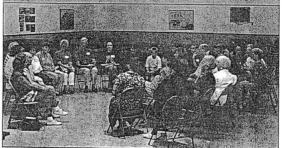
Victims, offenders, their families and others take part in conferences to resolve crimes in Washington County, Vt.

Restorative thinking can be applied to any crime. Victims should always be allowed to define the harm of the crime and what might help them heal. Offenders should always be encouraged to take responsibility for their behavior and make any amends possible. However, no single, restorative program is appropriate for all crime. While opportunities to repair harm are generally greater when the offender is kept in the community, violent offenders should be kept in secure facilities. Since part of the harm of crime is damage to the social fabric caused by fear of violent predators, they must be separated from the community. While in custody offenders can participate in community service and victim empathy groups, and victim panels can help violent offenders understand the impact of their behavior.